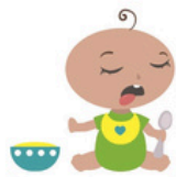
Loss of appetite